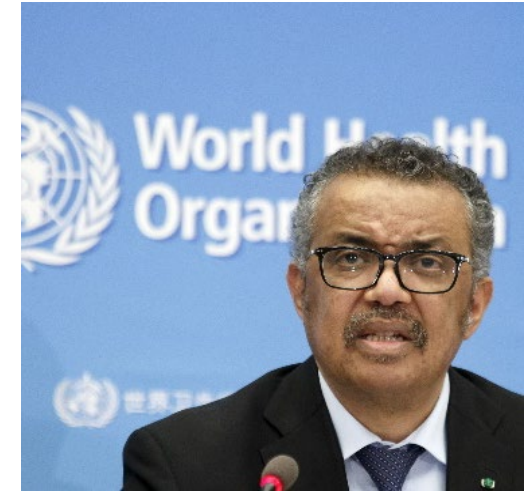
The president of the World Health Organization ("WHO") declared a COVID-19 pandemic