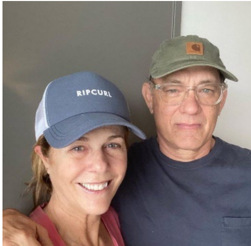
One of America's most beloved actors, Tom Hanks, announced on Twitter that he and wife Rita Wilson had contracted COVID-19 in Australia