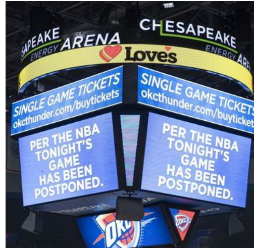
The NBA announced the suspension of the 2020 basketball season indefinitely